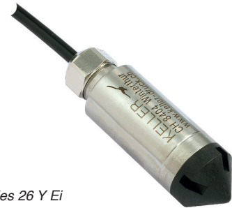
Series 26 Y Ei