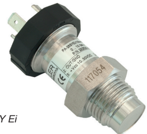
Series 25 Y Ei