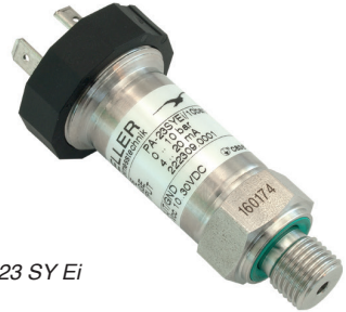
Series 23 SY Ei